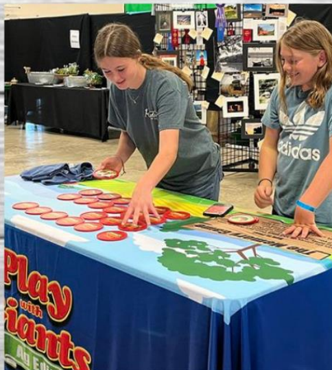
Play with Giants