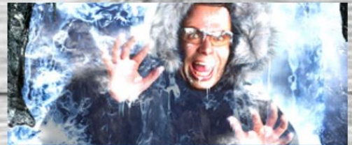
Freddy Fusion: Science Magic Show