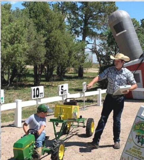
Kid's Pedal Tractor Pull