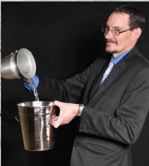
Disgo's Rootin' Tootin' Wild West Comedy Magic Show