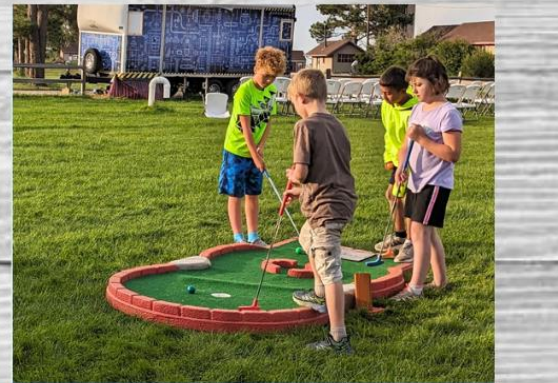
Mini-Golf & Laser Maze