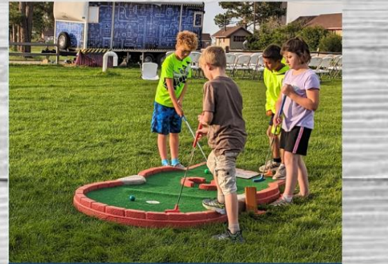
Mini-Golf & Laser Maze