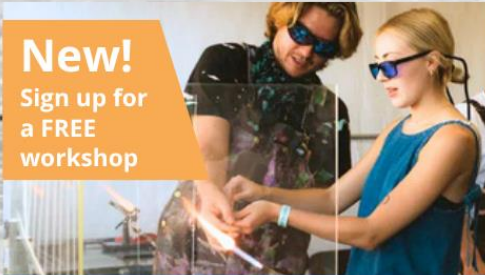
Glass Blowing Demos & Workshops