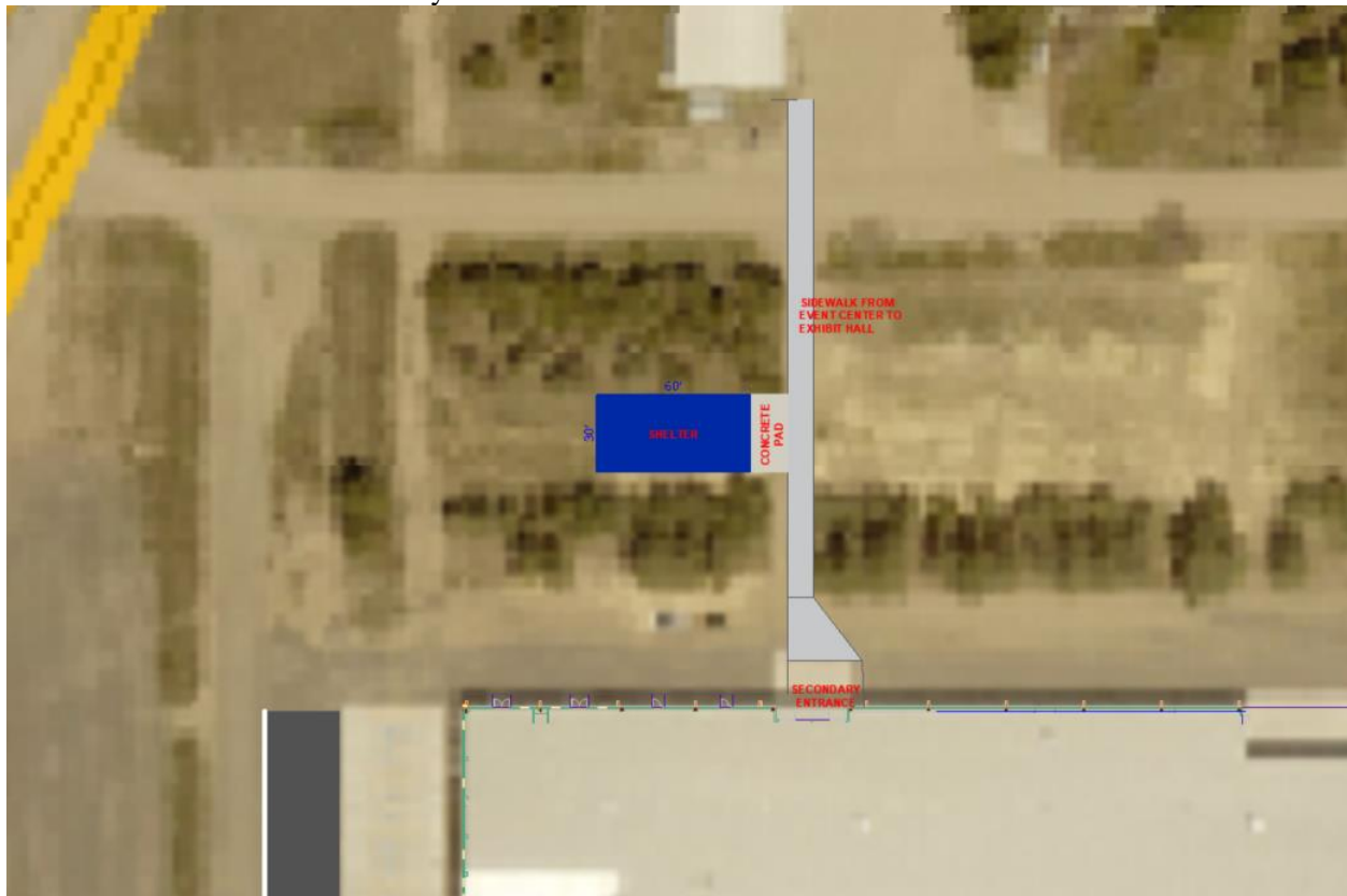
Exhibit A: Aerial shot of Midway Area

The Midway Area is an outdoor event space located north of the Event Center at Archer. This space is primarily utilized during the Laramie County Fair for our Midway, which features several food trucks and various forms of entertainment. The west edge of the Midway Area, where this shelter is to be located, is currently not utilized. It is located within two rows of trees. This area, paired with a shelter, will make for a great picnic area, and can be rented during non-Fair time.